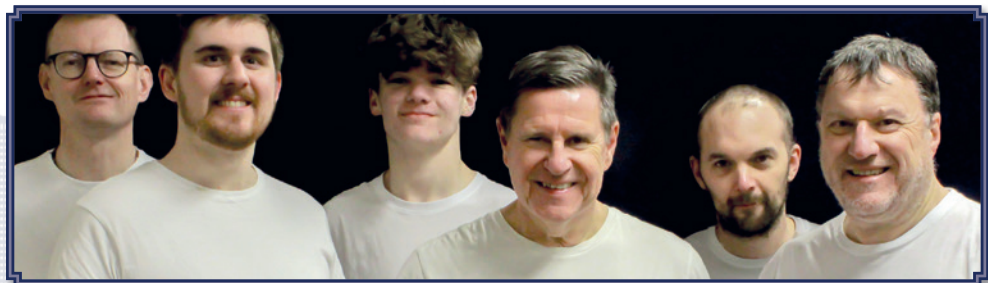
Gamblers (left to right)