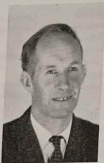
Pluto.