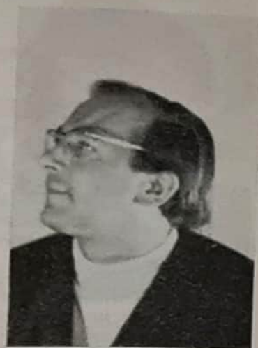
Orpheus. John Gould