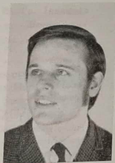
Bacchus.