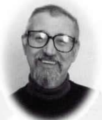
Pish-Tush Alan Swift A Noble Lord