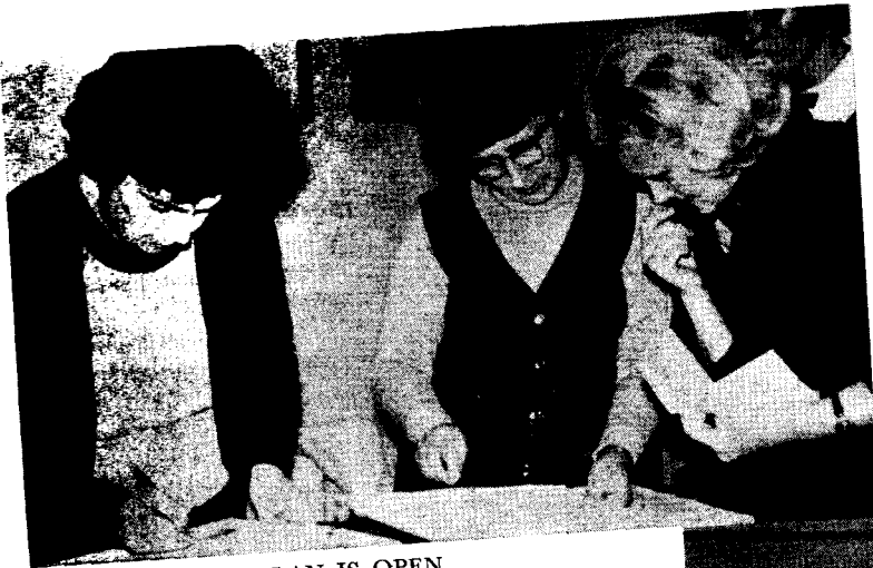
THE BOOKING PLAN IS OPEN