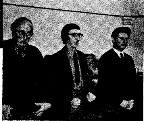
THREE HULKING BROTHERS