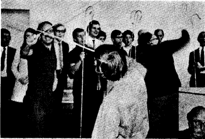
O DOUGHTY SONS OF HUNGARY